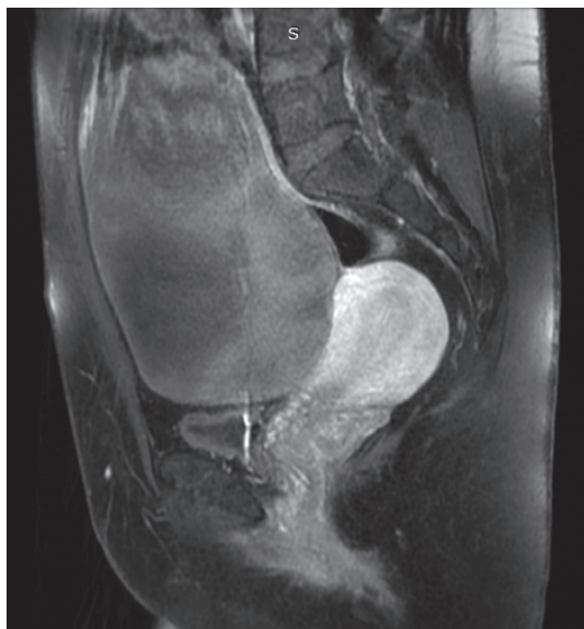
Fig. 1. Magnetic resonance image (MRI) of the studied pelvi-abdominal mass