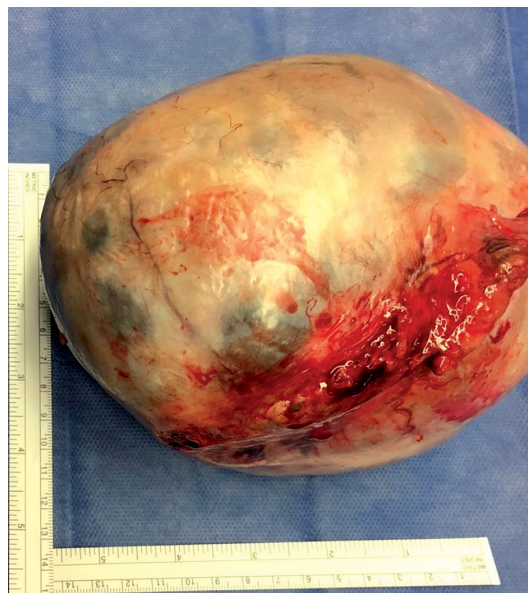
Fig. 4. Post-operative image of the excised adnexa including the ovary, containing the ovarian cyst and the right fallopian tube

infundibulopelvic and the utero-ovarian ligaments (adnexal torsion) (Fig. 2).