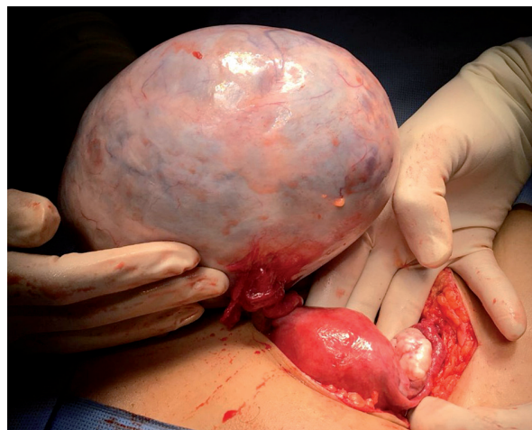
Fig. 2. Intra-operative image shows torsion of the right adnexa